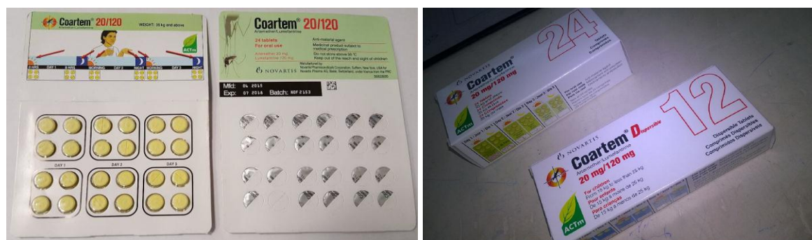
The visual of the Wallet Pack Counterfeit Coartem® pack. The genuine Green Leaf Coartem® in a blister in a box pack

NDA Quality Control Laboratory tested the Wallet Pack Counterfeit Coartem® and results indicated no active ingredients of Artemether or Lumefantrine.